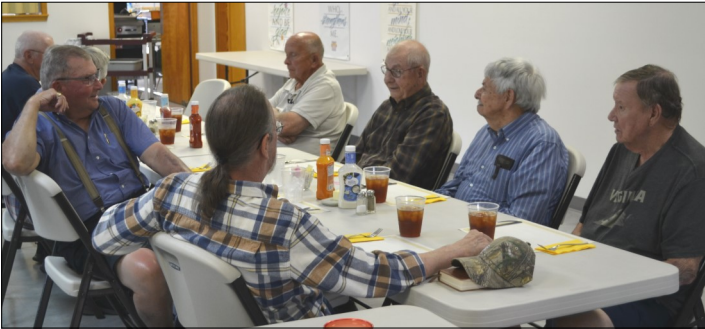
U. M. Men gather for a meal and for ministry