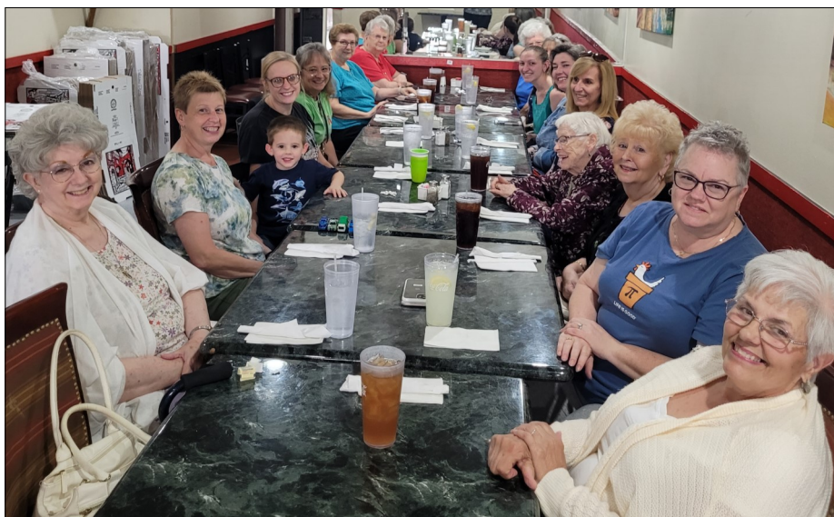
The women enjoyed great conversation at Ladies Night Out